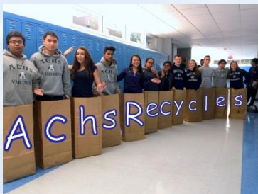
Atlantic City High School (Atlantic City, NJ)