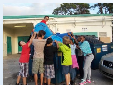
Driftwood Middle School (Hollywood, FL)