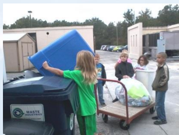
Bellamy Elementary School (Wilmington, NC)